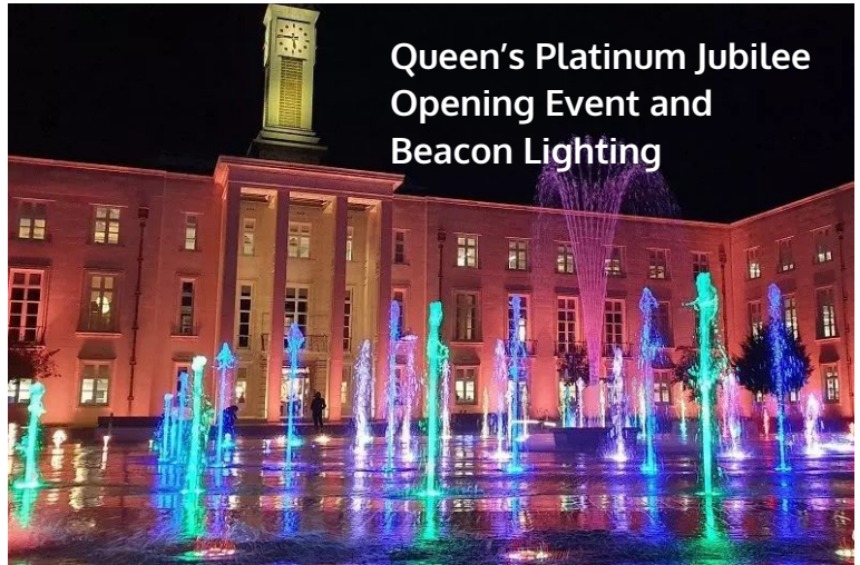
Queen's Platinum Jubilee Opening Event and Beacon Lighting

Call 075 3083 0447 / 075 0469 3531 for stall bookings, T&C apply